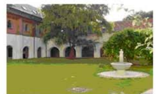
Brno, Czech Republic: Gregor Mendel's Abbey where the course will begin.